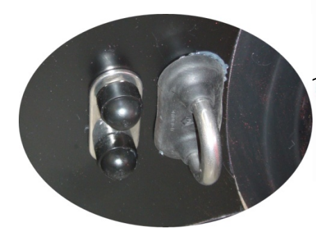
Lifting and Towing Points