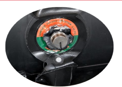
Intercommunication / Inflation Valves