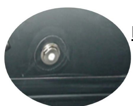
Fast Inflation Points