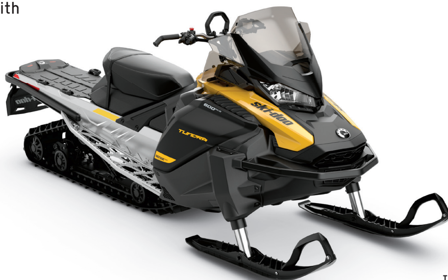
TUNDRA™ LT 600 ACE™ SHOWN

Great off-trail and deep-snow performance with light-utility capability.