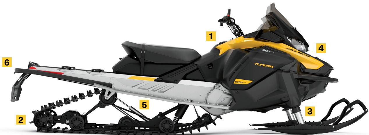
TUNDRA™ LT 600 EFI SHOWN

Industry-exclusive telescopic front suspension enables a large, flat belly pan for exceptional deep-snow flotation.