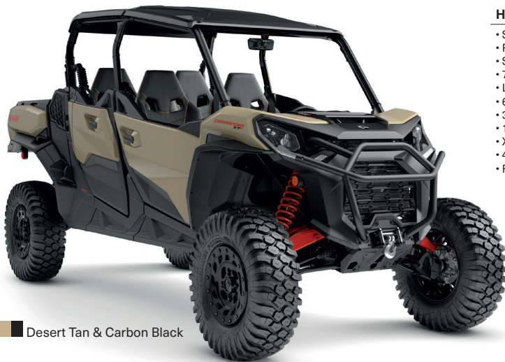
Desert Tan & Carbon Black