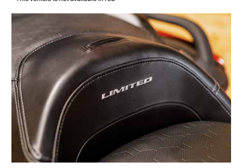
ULTRA COMFORTABLE HEATED SEATS

With the 23 in. (58.4 cm) touring floorboards, riders can now sit however they are most comfortable and change leg positions on long rides while enjoying easy access to the brakes.*