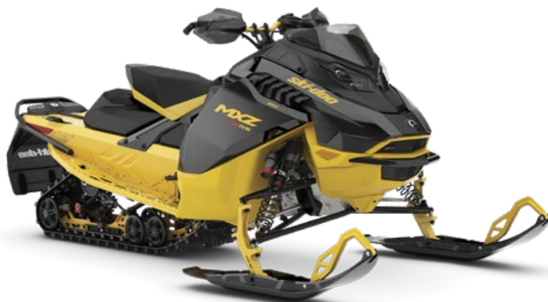
MXZ X-RS 850 E-TEC SHOWN