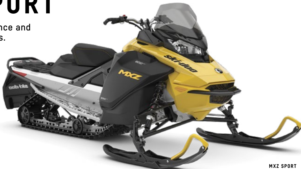
MXZ SPORT 600 EFI SHOWN

Dynamic trail performance and value-oriented features.