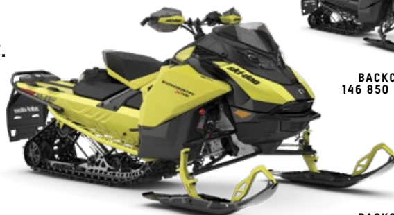
BACKCOUNTRY X-RS 146 850 E-TEC SHOWN